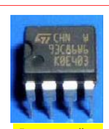
Eeprom supplier: ST (brown writing)