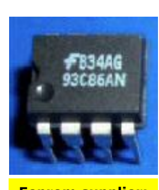
Eeprom supplier: Fairchild (white writing)

As described in the "products concerned" section, the fault only occurs when the card or eeprom is replaced and not matched correctly (therefore check stocks in your warehouse, keeping in mind that the Fairchild supplier no longer exists).