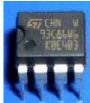
Eeprom supplier: ST (brown writing)