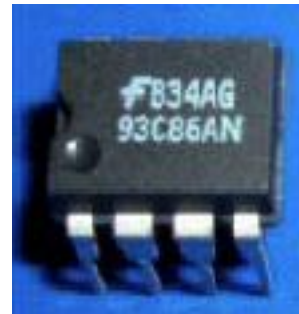
Eeprom supplier: Fairchild (white writing)

As described in the "products concerned" section, the fault only occurs when the card or eeprom is replaced and not matched correctly (therefore check stocks in your warehouse, keeping in mind that the Fairchild supplier no longer exists).